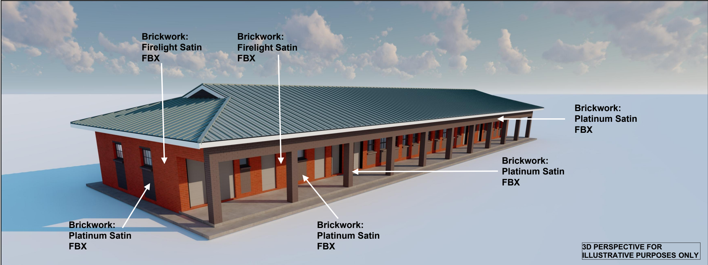
Typical Brickwork Specifications for all buildings